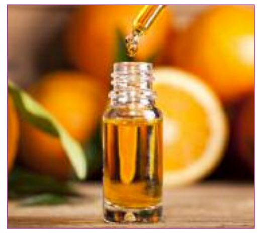
Natural orange oil.

In addition to the thermal treatment of solids, fluid bed